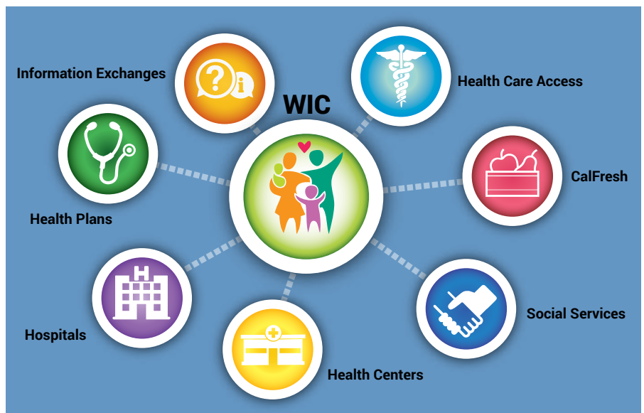
Linkages between WIC and other programs would benefit more eligible families.

In California, the state Department of Public Health (CDPH), manages the California WIC program by contracting with 84 local agencies that provide direct services. Compared to other federal benefits programs, which are often managed at the local level by county health departments, California WIC local agencies are administered by six types of local parent organizations. At the time of the survey, 39 county health departments served approximately 38%