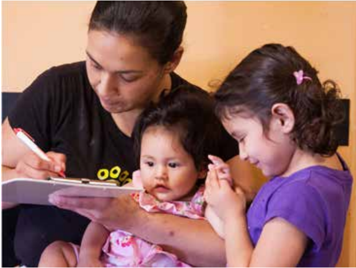
Busy parents need streamlined program linkages