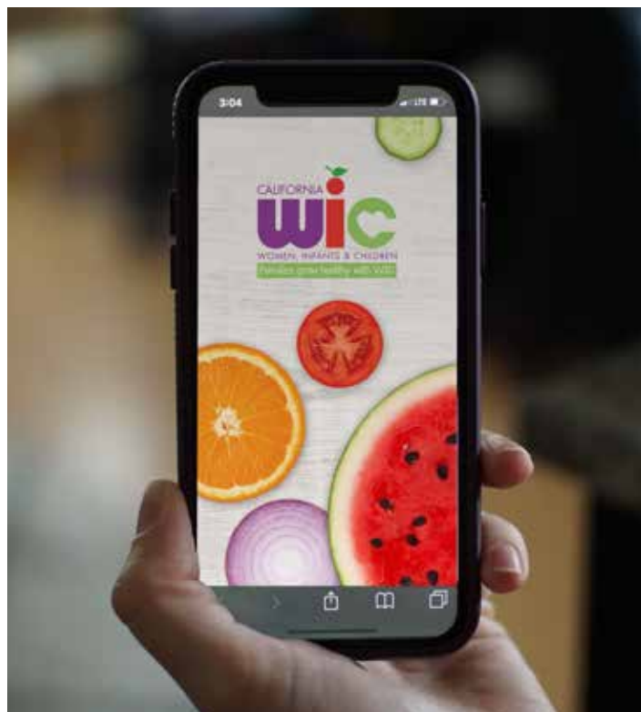
The new California WIC app could be a key part of horizontal integration, linking WIC participants with other needed services using technology young families expect.

The state's current goal is that by 2024 there will be one electronic information and application portal through the California Statewide Automated Welfare System (CalSAWS), supported by the California Healthcare Eligibility, Enrollment and Retention System portal (CalHEERS). 23-27 WIC is not included in the current work underway for the new system, but plans should begin for CalSAWS to be configured to include simultaneous exposure to WIC.