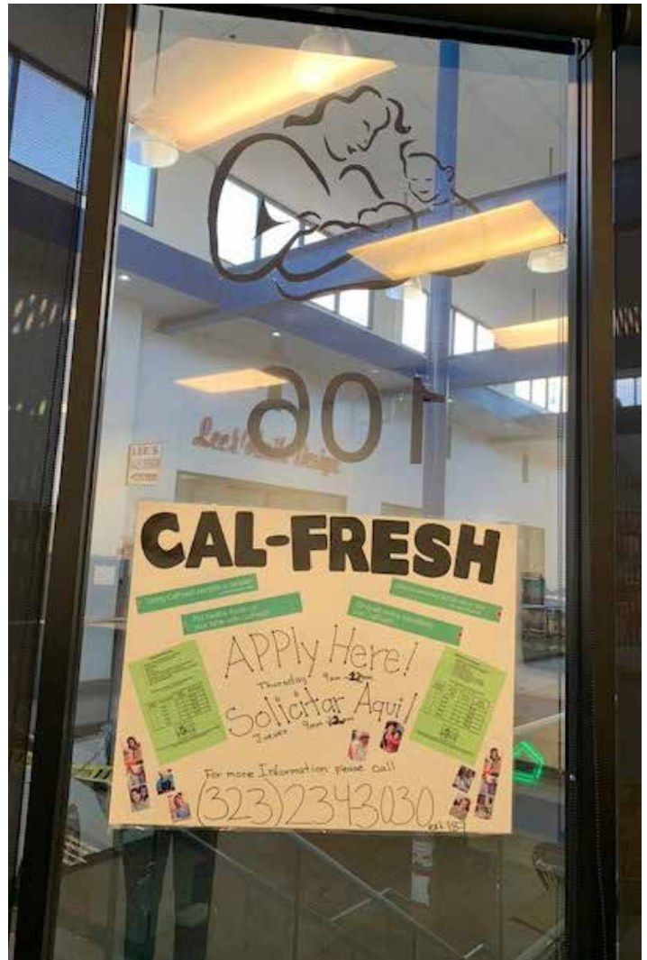
With more remote services expected, onsite application assistants may be less effective.

Thirteen local WIC agencies, nine of which are located in county health departments, have MOUs to share information with a variety of social service programs, including Head Start; a food bank with access to CalFresh information; and public health nursing, which could make referrals to WIC from several programs such as Black Infant Health and home visiting programs. In some cases, ENPs are identified and contact information supplied. In one case, referrals are made with a warm hand-off when staff from other programs accompany WIC-eligible participants to the WIC office in the same building.