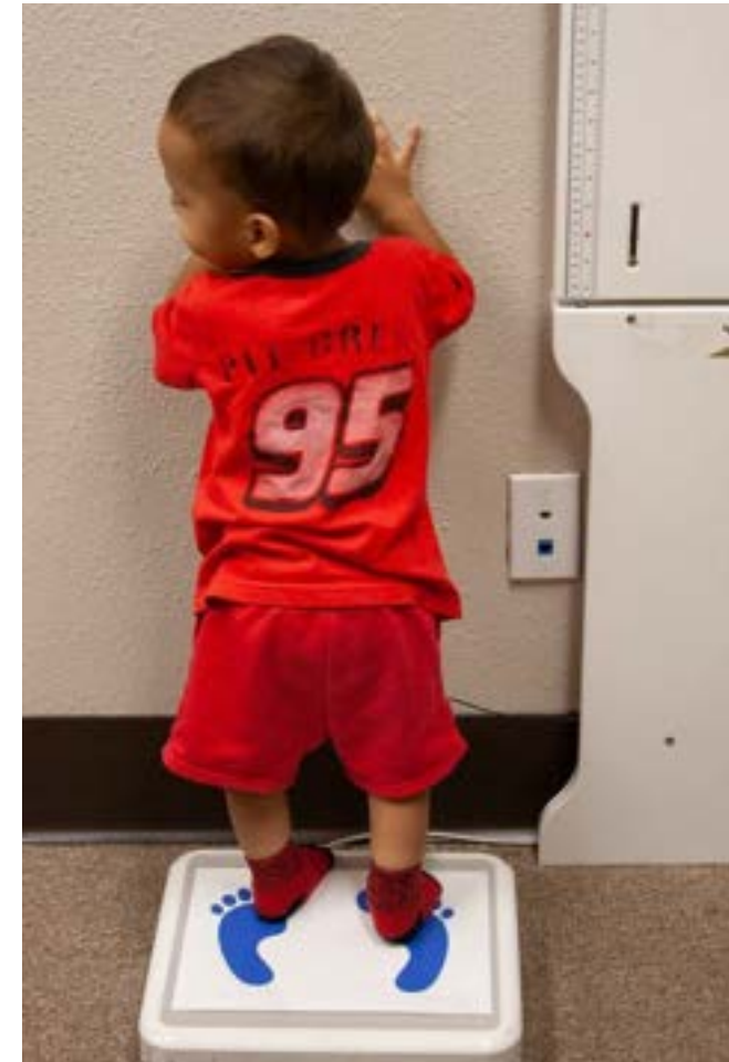
Shasta County WIC