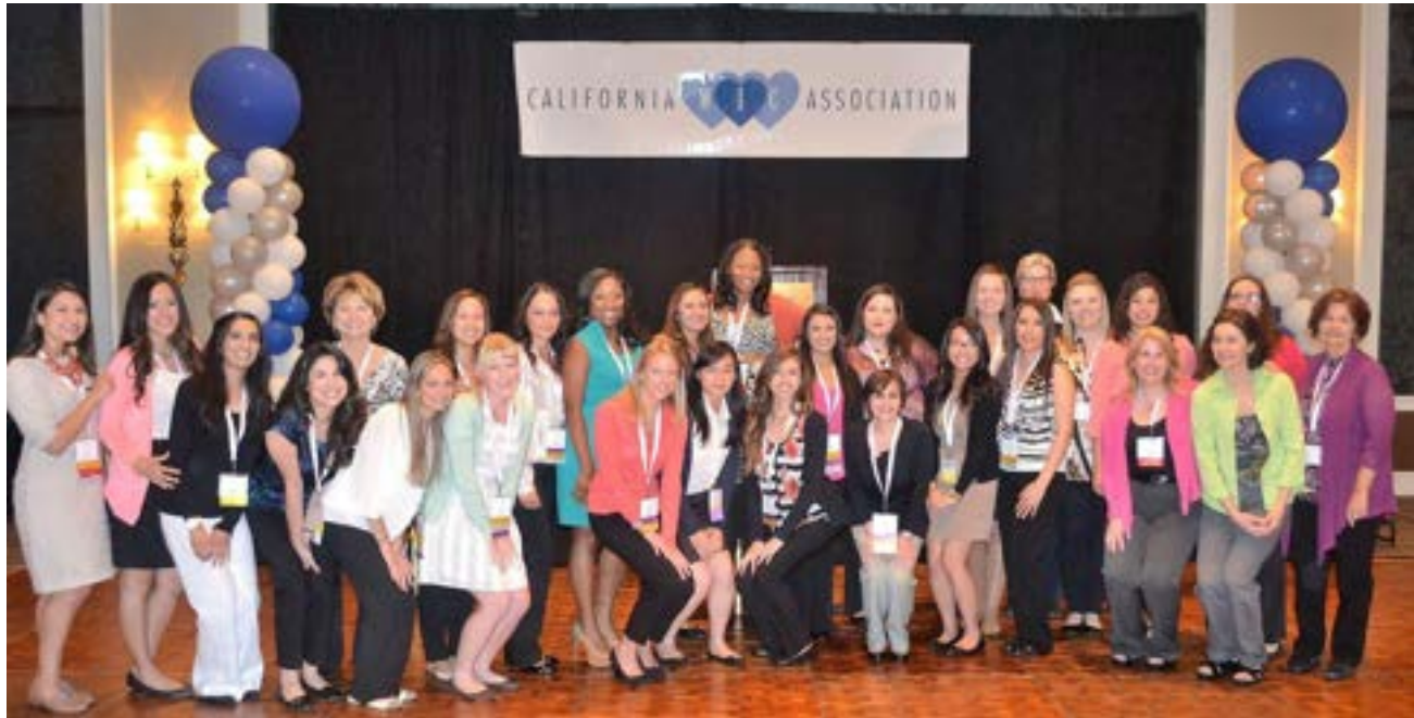
Dietetic Interns and CA Nutrition Corps Scholarship Recipients