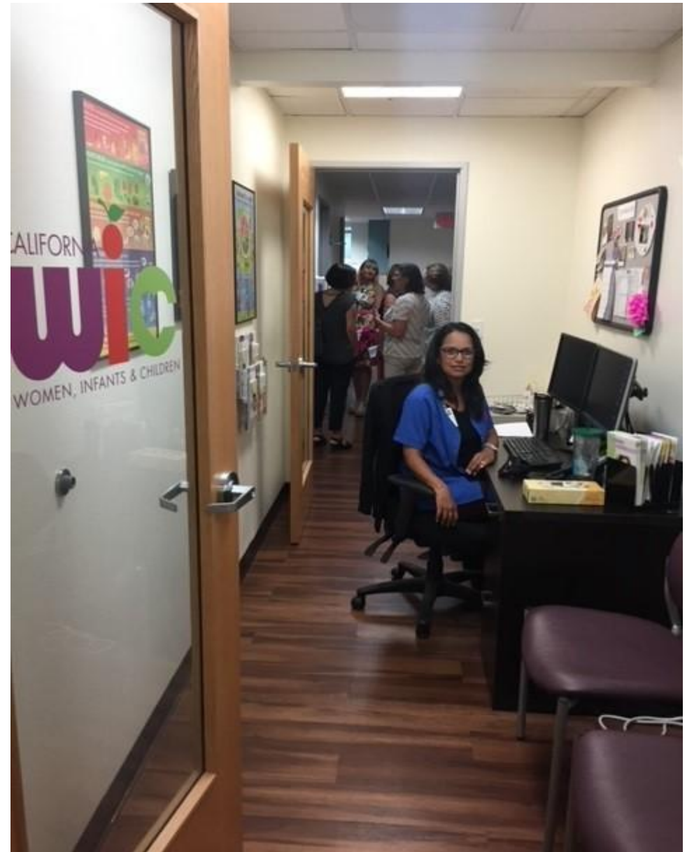
WIC office between pediatrics and women's health TrueCare Health Center, San Diego