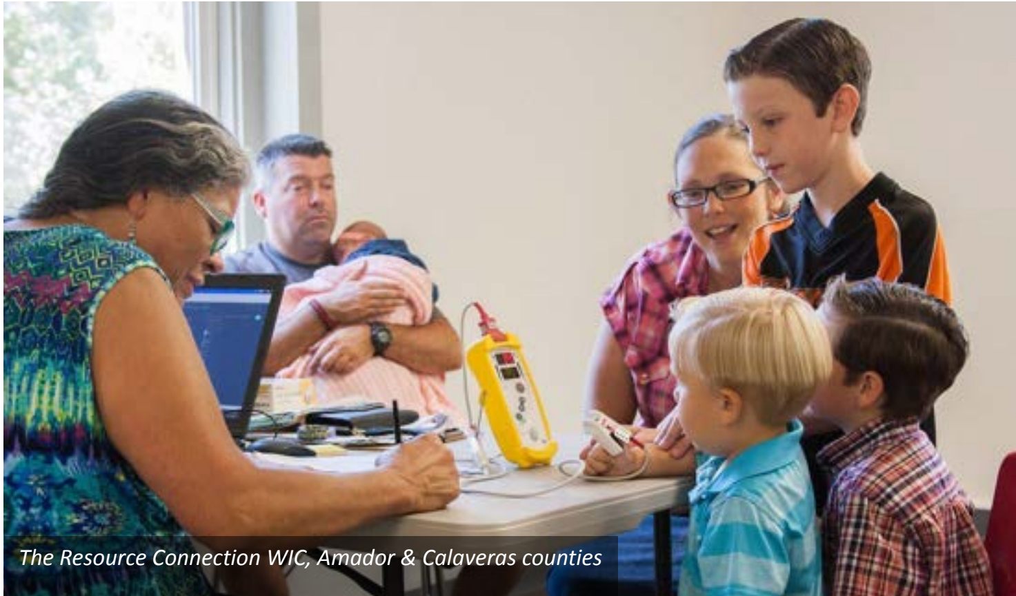
The Resource Connection WIC, Amador & Calaveras counties