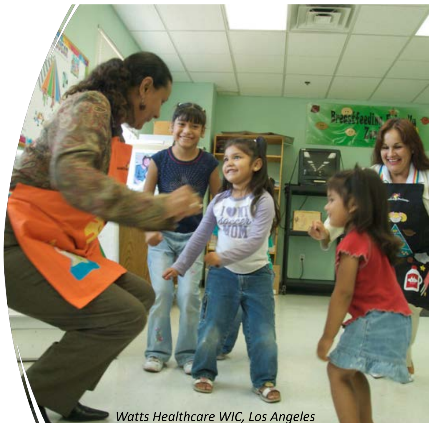
Watts Healthcare WIC, Los Angeles