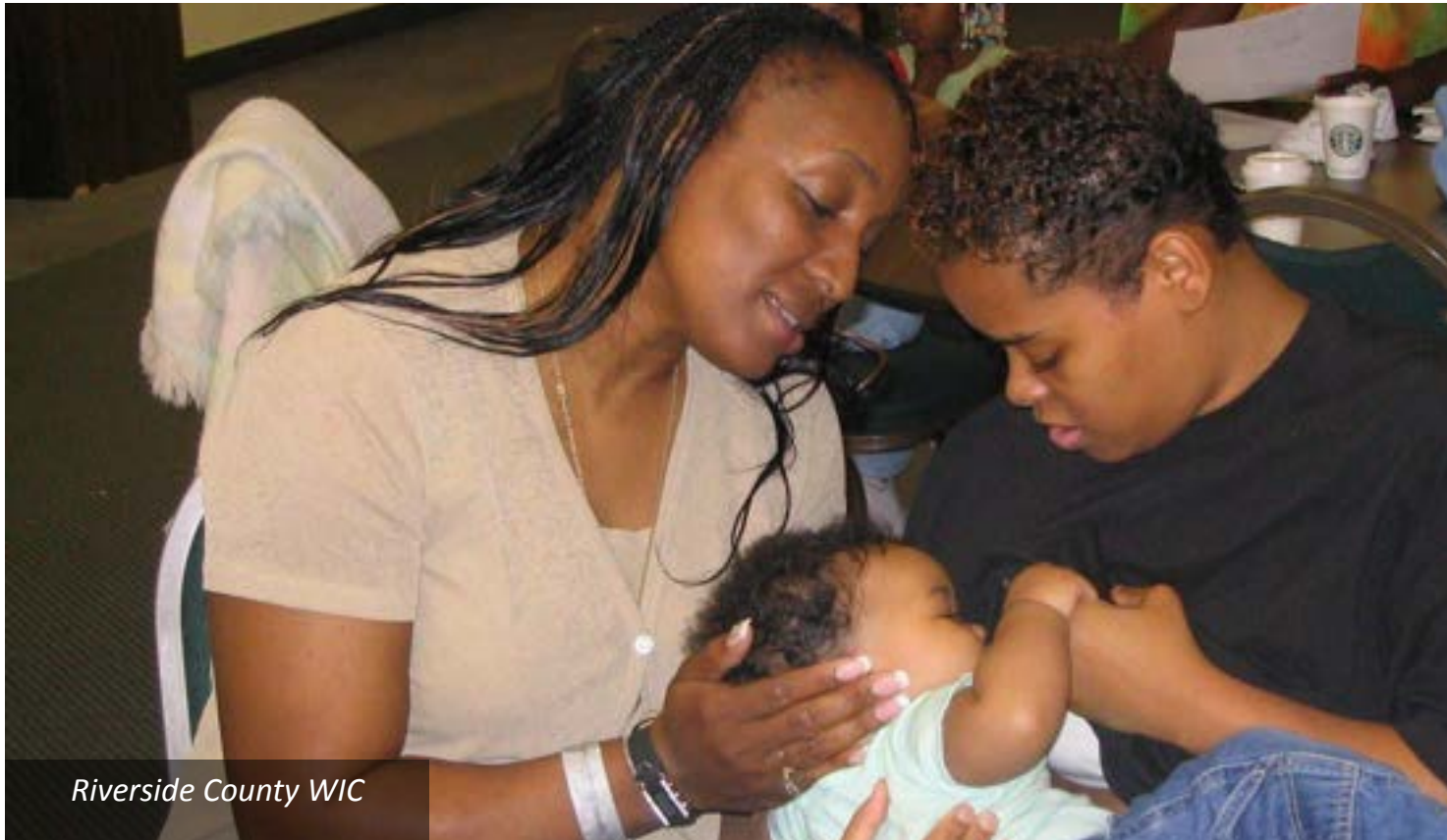
Riverside County WIC